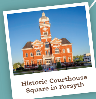
Historic Courthouse Square in Forsyth