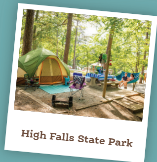
High Falls State Park