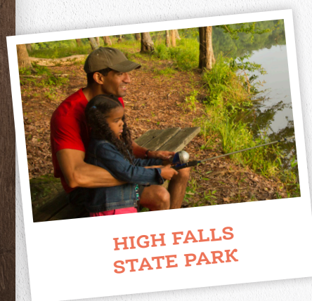
HIGH FALLS STATE PARK

Explore the falls and trails of High Falls State Park or fish and paddle on its 700-acre lake. Visit with the live animals at Hamlin Hills and sample the healing spring water of Indian Springs State Park , or go birdwatching and hunting in the 6,000-acre Rum Creek Wildlife Management Area surrounding Lake Juliette . Dames Ferry Park has acres of forest and lake activities, while the Forsyth Golf Club offers 18 pristine holes to putt in!