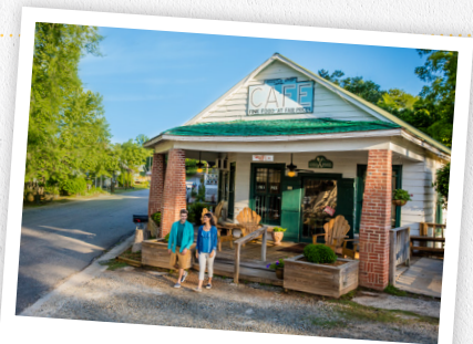
WHISTLE STOP CAFÉ

Step onto the set of Fried Green Tomatoes in the tiny town of Juliette, where you can enjoy the legendary hospitality of the Whistle Stop Café, or take a tour of other film locations from the movies Anchorman 2 , Baby Driver , First Man , The War , Cockfighter and more!