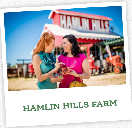
HAMLIN HILLS FARM