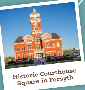
Historic Courthouse Square in Forsyth