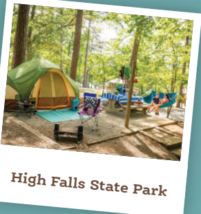
High Falls State Park