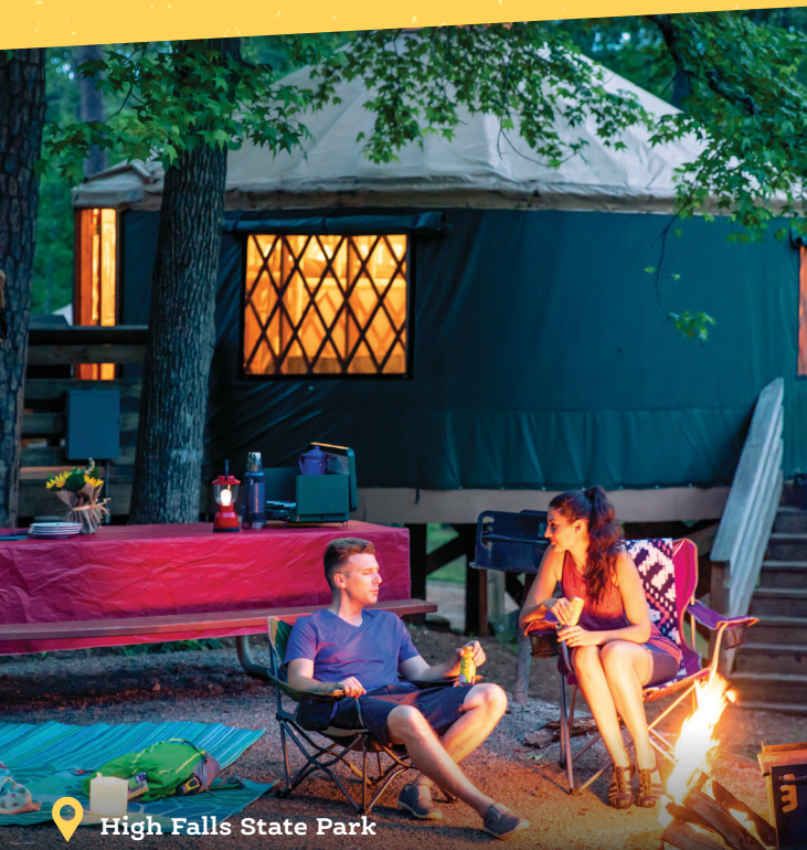
High Falls State Park

A "Great Georgia Road Trip" would be incomplete without visiting High Falls State Park and the state's unofficial Fried Green Tomato capital along the way. The quaint, historic setting of Downtown Forsyth, with its eclectic array of local shopping and dining, is a great place to set up camp for a few days as you explore the incredible adventures to be had nearby!